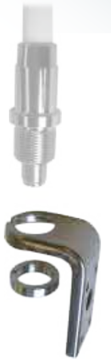
15533 - MAST L BRACKET