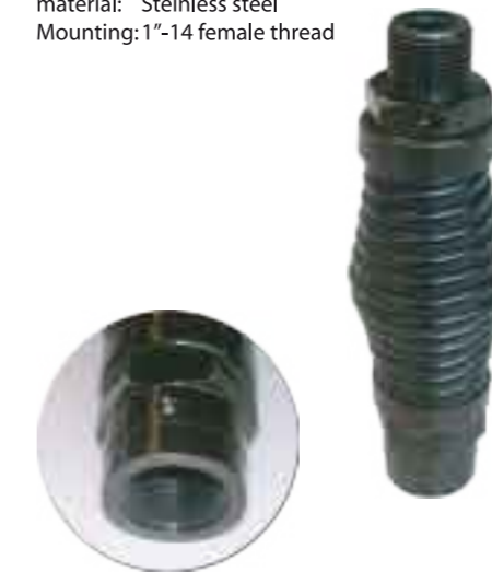
15630 - BIG SPRING material: Stainless steel Mounting: 1"-14 female thread